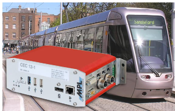
RAIL-CEC10 for rugged Railway Applications