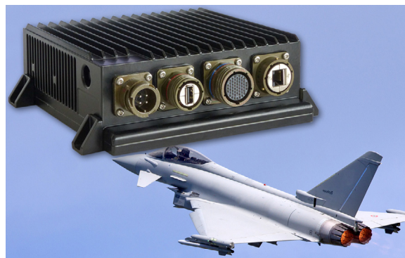
MIL-CEC10 for use in Military Environments